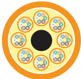
48-fibers (8 tubes of 6-fibers)