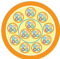
48-fibers (12 tubes of 4-fibers)