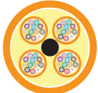
48-fibers (4 tubes of 12-fibers)